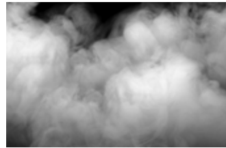
A dense white cloud or fog