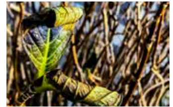
Dead or discolored vegetation