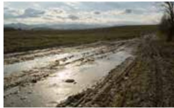
A pool of liquid on the ground